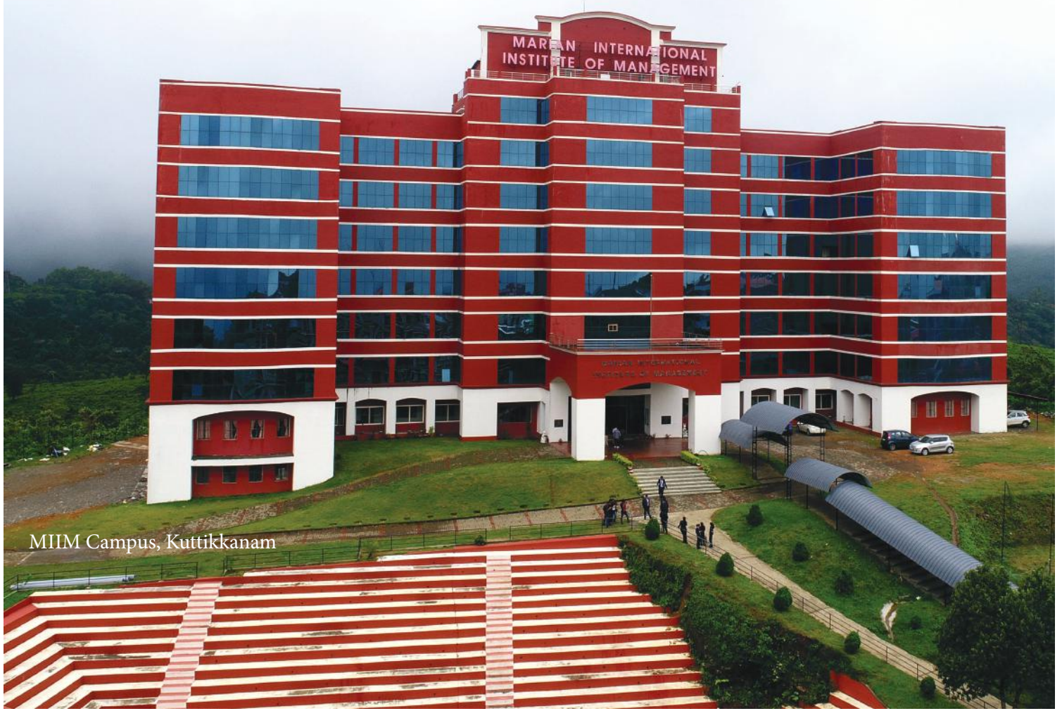
MIIM Campus, Kuttikkanam

Marian International Institute of Management Kuttikkanam, Idukki (Dist.) Kerala Ph. 04869 233922, Fax : 04869 233924 Email : director@miim.ac.in , www.miim.ac.in