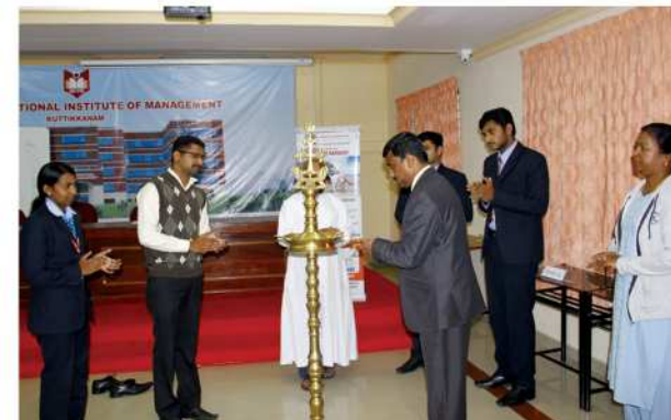
Inauguration of FINEX CLUB