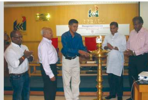
Lighting of II nd Management Conclave