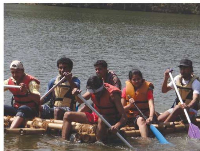
Students in various programs at Suryanelli