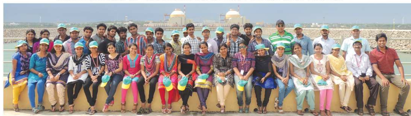
INDUSTRIAL VISIT AT KOODUNKULAM ATOMIC POWER PLANT -B BATCH