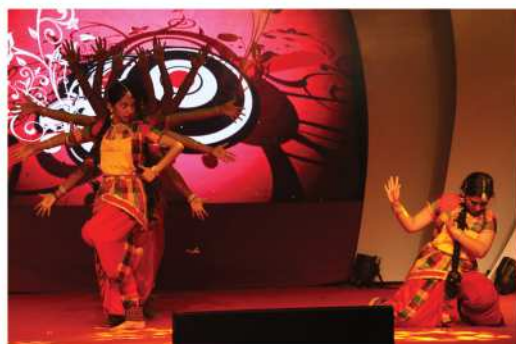
Cultural Programmes YOLO NITE - 4