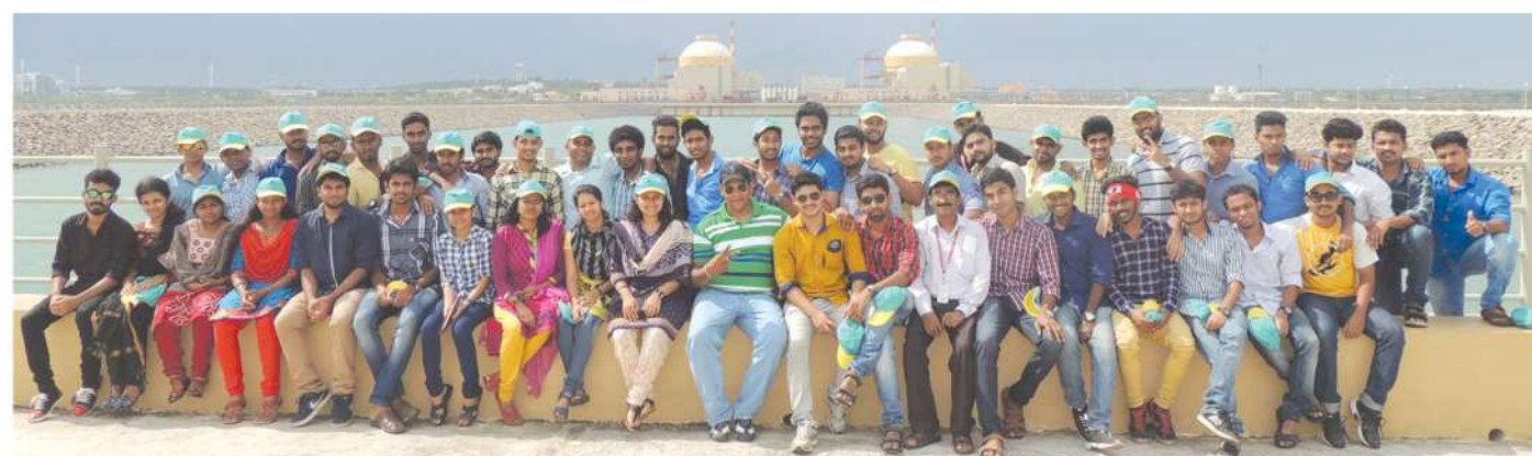
INDUSTRIAL VISIT AT KOODUNKULAM ATOMIC POWER PLANT -A BATCH

MIIM organized Industrial Visits at the nearby industries like, CONNEMARIA TEA FACTORY, Vandiperiyar and PDS Organic Spices, Kuttikkanam to know about the functioning of the industries and familiarize about the gap in theory and practice. The second year students of MIIM got a rare chance to visit ATOMIC POWER PLANT at Koodunkulam. The students attended a seminar, which was conducted by experts from the power plant, which thoroughly explained the functioning and visited the various plants and mechanical parts and explained how industrial waste is cleaned. Students cleared the doubts through the interactive sessions and they were happy to take photograph and arrangement for lunch and refreshments for the 120 students.