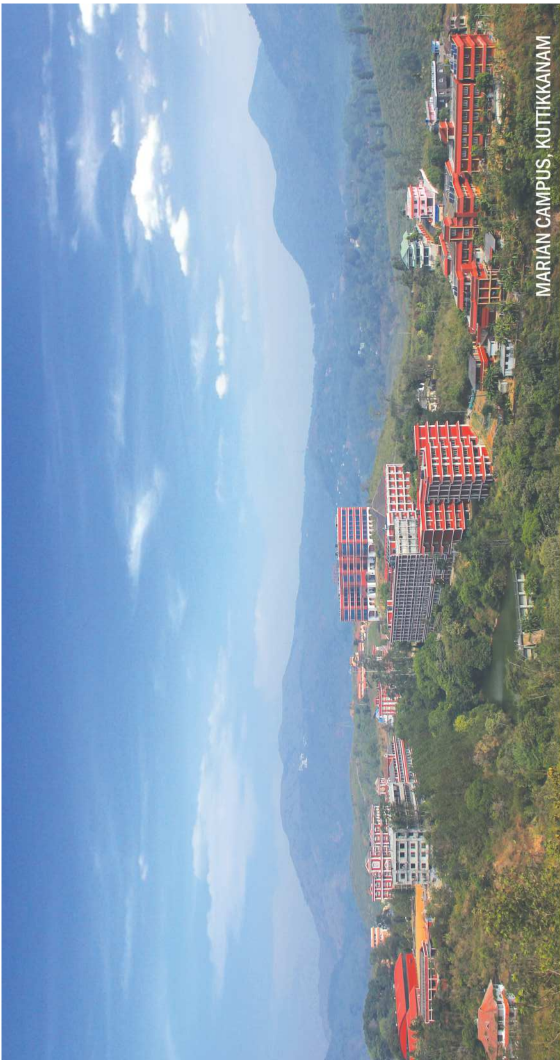
MARIAN CAMPUS, KUTTIKANAM