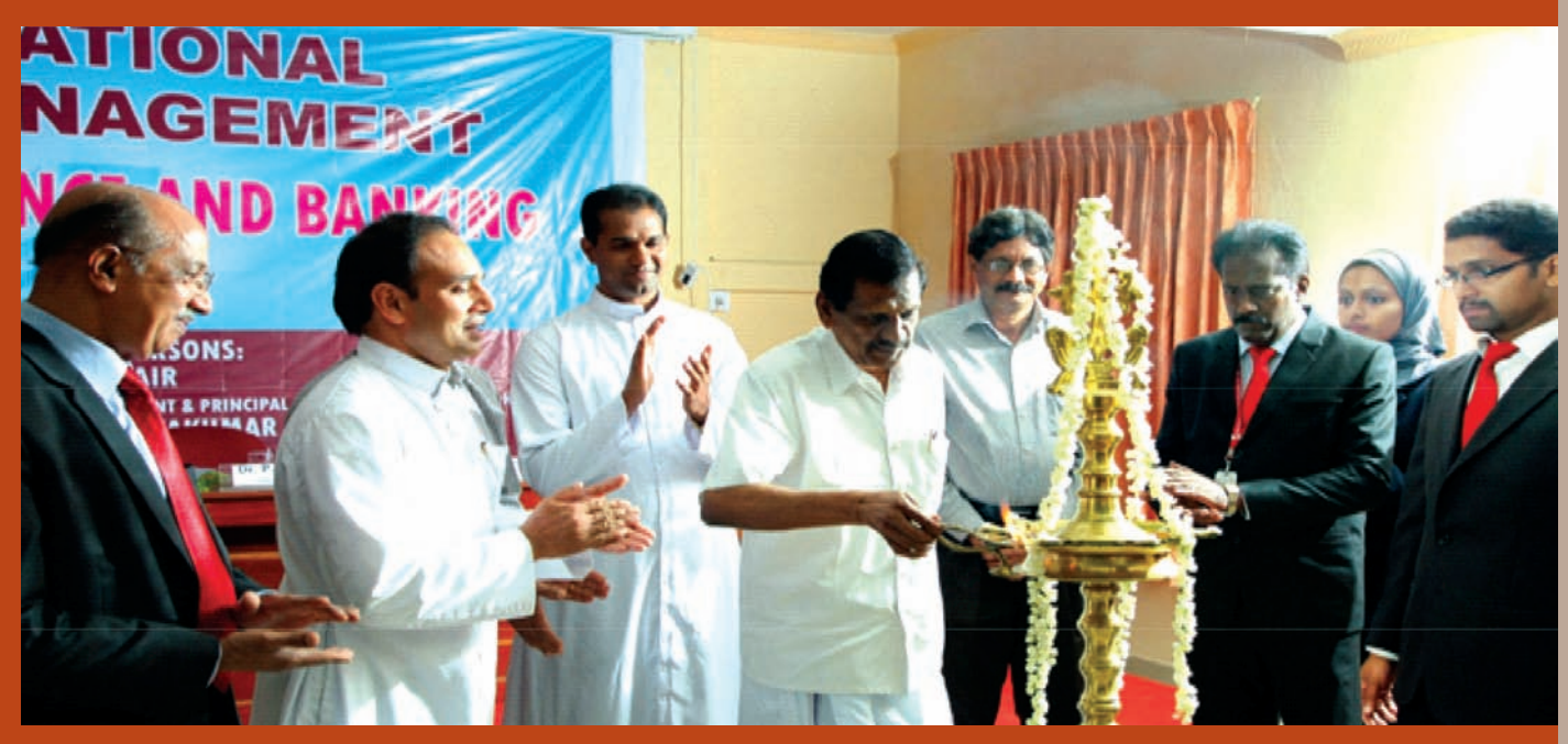
Inauguration of Finance Club by P.J. Joseph, Honorable Minister of Water Resources, Govt. of Kerala