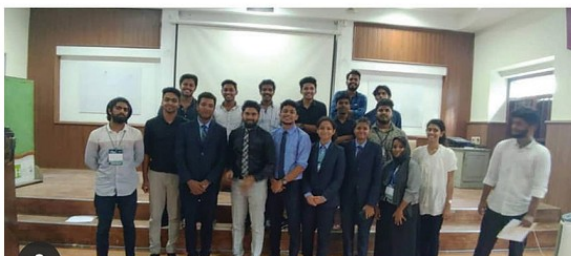
SACRED HEART FEST WINNERS