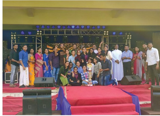
MACFAST FEST WINNERS