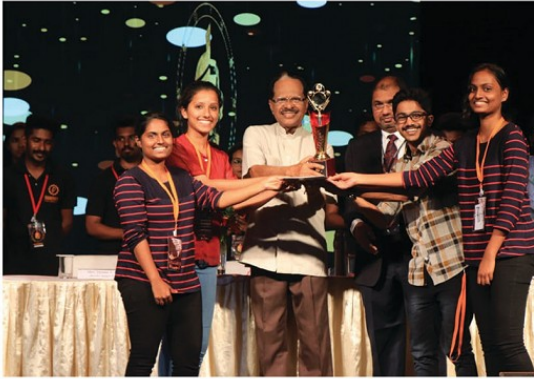
SAINTGITS FEST WINNERS